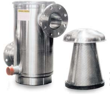
Conical filter removed from shell.